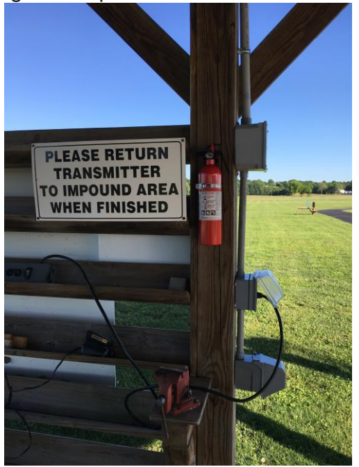
Page 2 of 4

SLRCFA has Two fire extinguishers available for members to use if an emergency arises. One is near the Transmitter Impound area and the other much larger extinguisher is located INSIDE of the largest grill. Please contact a SLRCFA board member if one of these extinguishers are used so that it may be recharged or replaced.